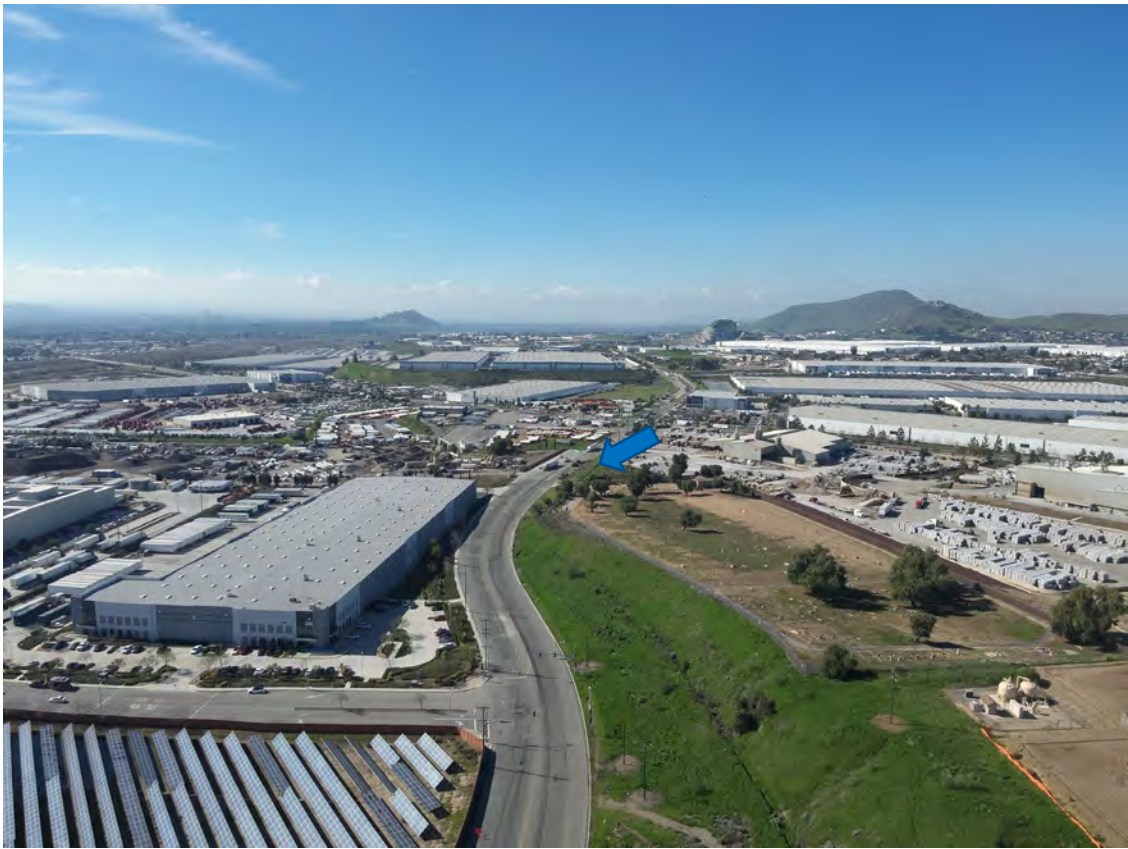
Figure 4: Looking West along Agua Mansa Road