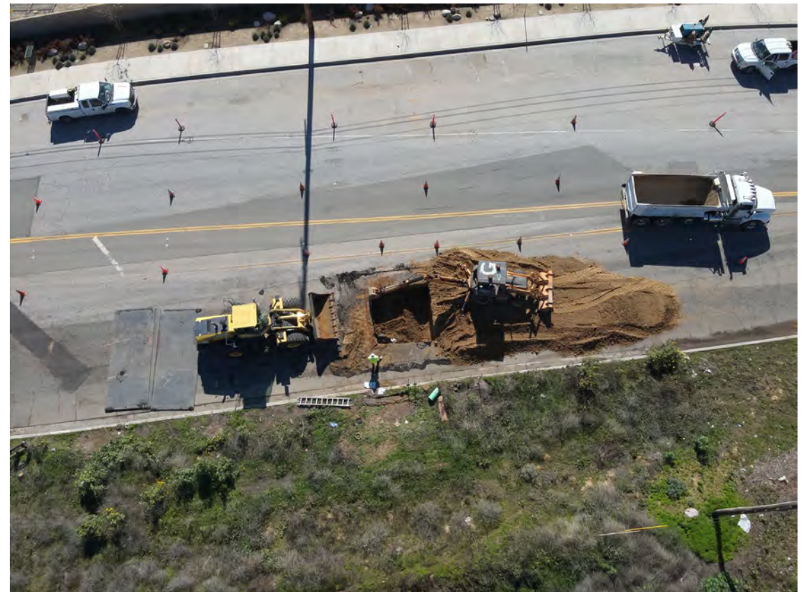
Figure 2: Excavation for tie-in to existing 36" Brine Line.