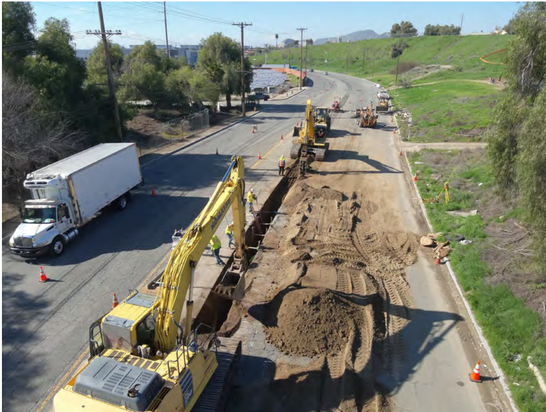
Figure 1: Excavation, installation and backfill of pipe.