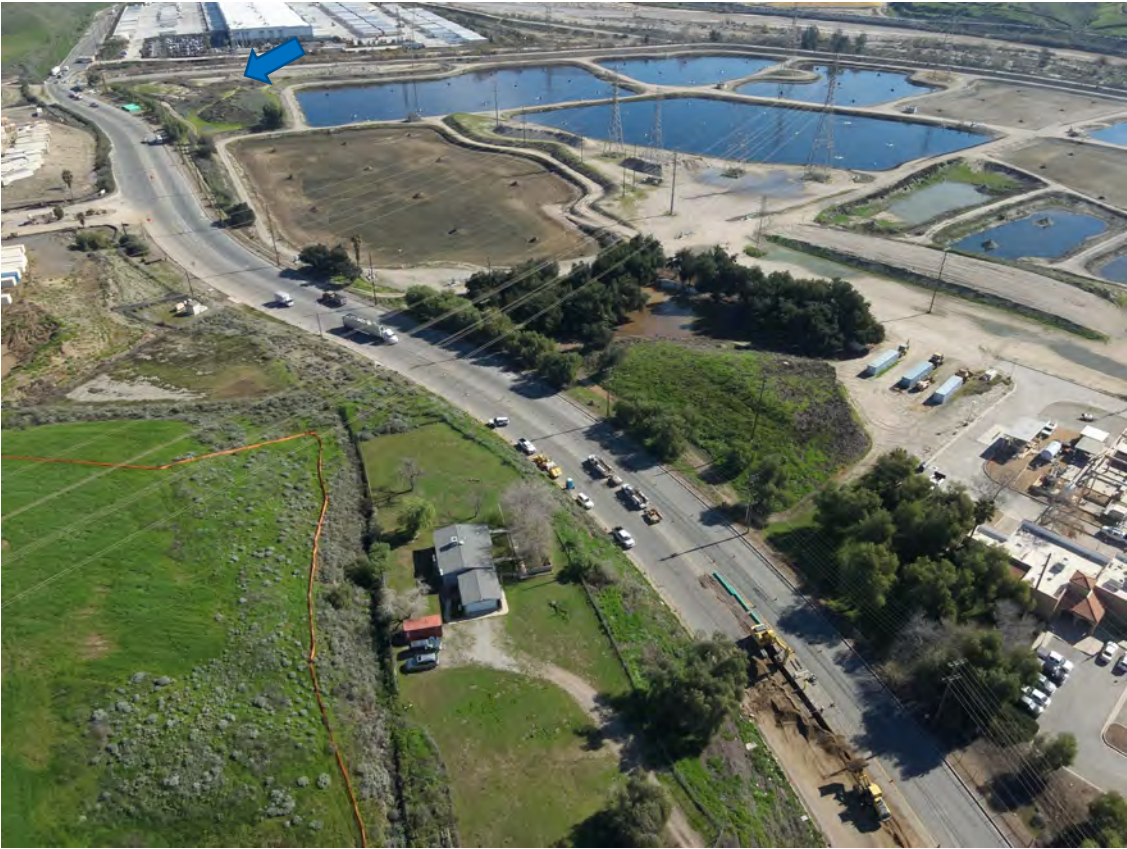
Figure 3: Looking East along Agua Mansa Road