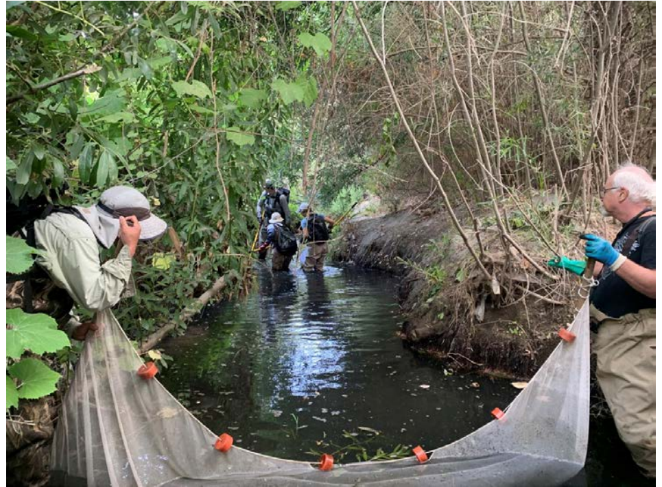
2019 Electroshocking effort