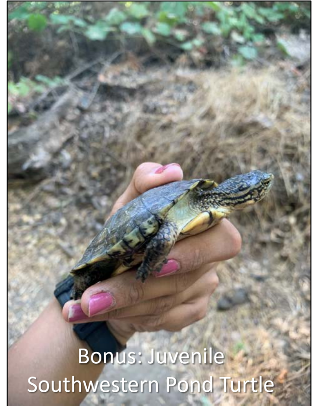
Bonus: Juvenile Southwestern Pond Turtle