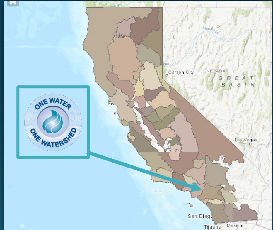
Map of IRWM Regions