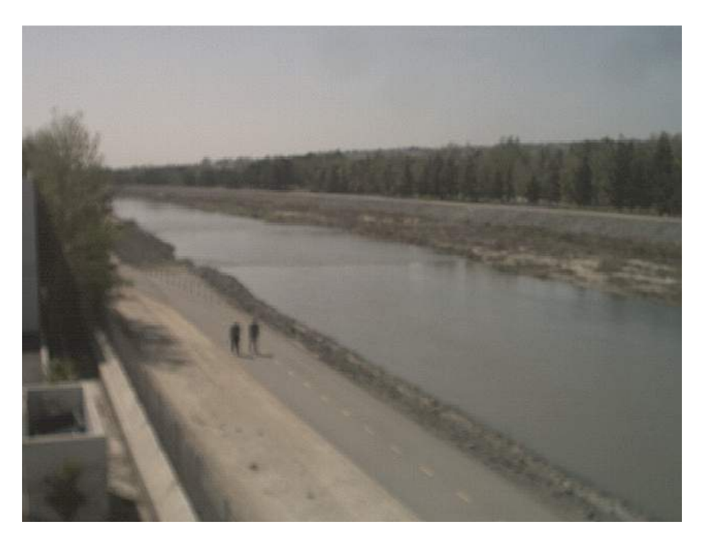
Non-Contact Activity: 03/27/2008 14:30