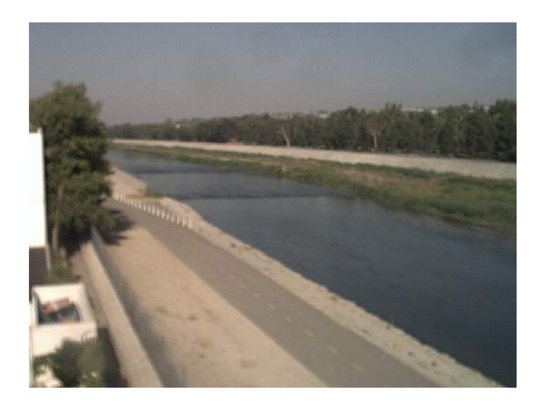
No Activity: 06/17/2008 08:30