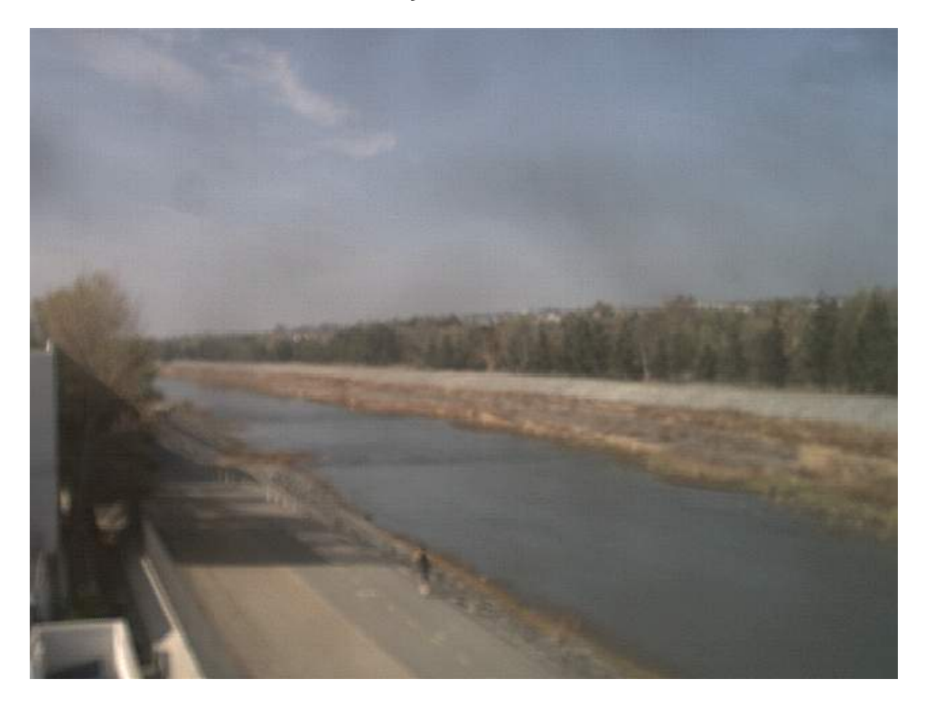
Non-Contact Activity: 10/30/2007 11:31