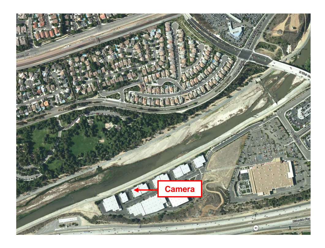
Figure 1 Santa Ana River at Anaheim Survey Location