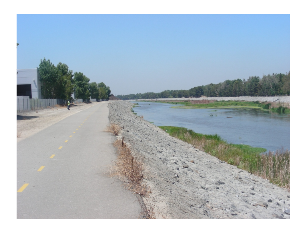
Figure 2 Photo of Santa Ana River at Anaheim Survey Location