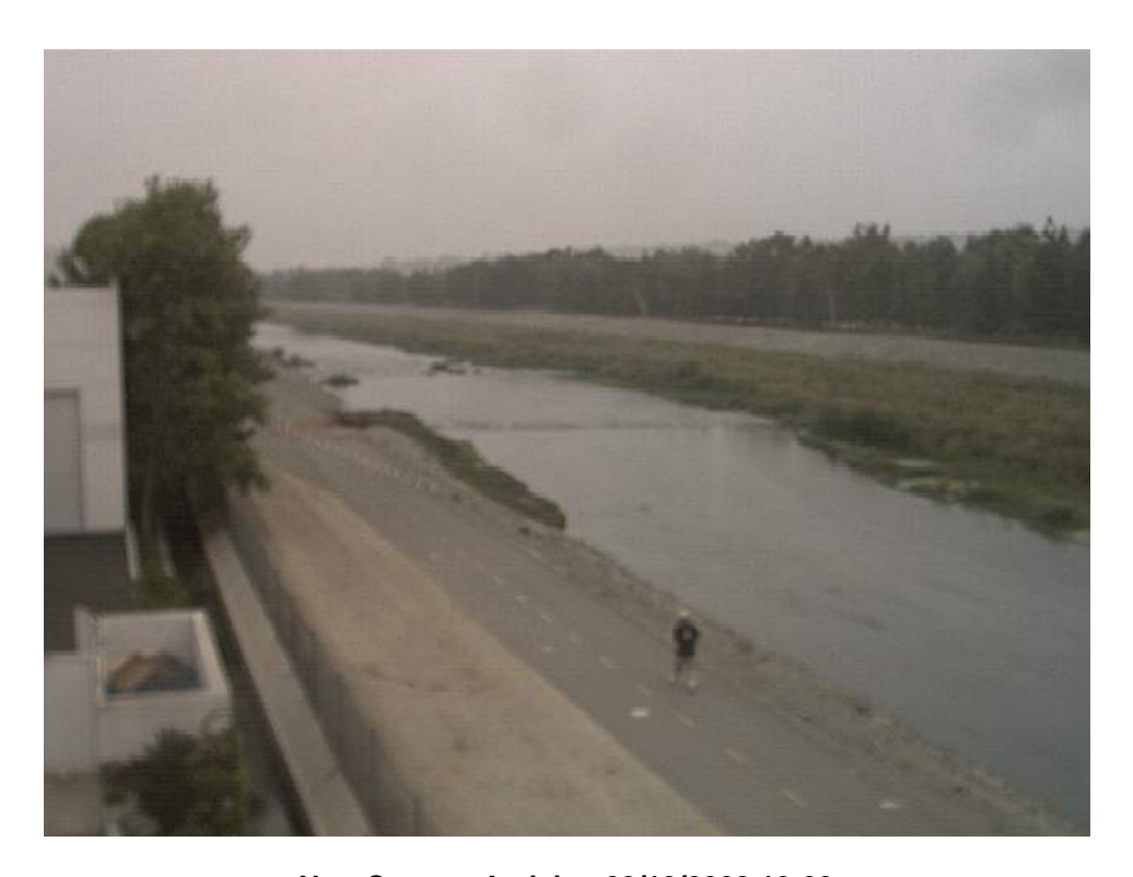
Non-Contact Activity: 09/13/2008 10:00