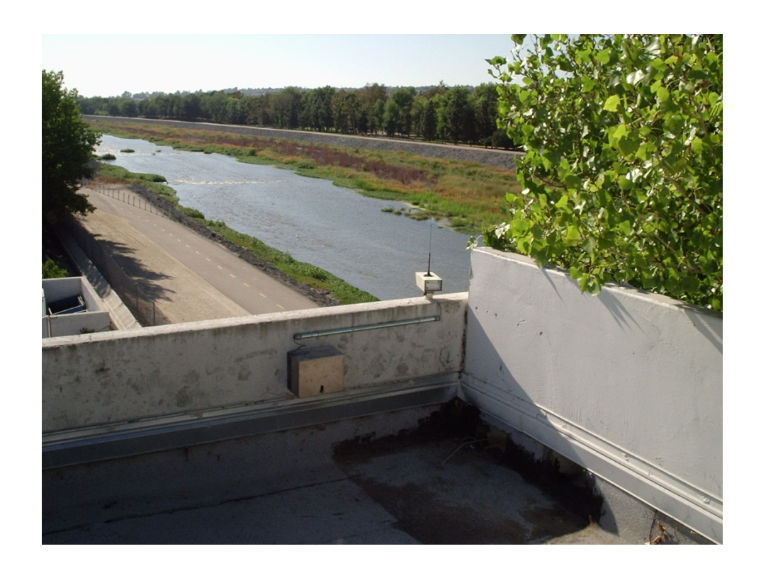
Figure 3 Photo of the Recreational Use Survey Camera Installation for Santa Ana River at Anaheim

Table 1 summarizes the survey duration and number of images collected from Santa Ana River at Anaheim between October 2, 2007 and October 5, 2008. An image was collected every fifteen minutes throughout the study duration unless signal strength fluctuations or equipment failures precluded collection and transmission. Images were not collected at night due to darkness.