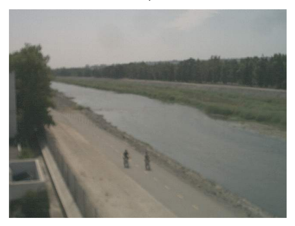
Non-Contact Activity: 08/07/2008 14:45