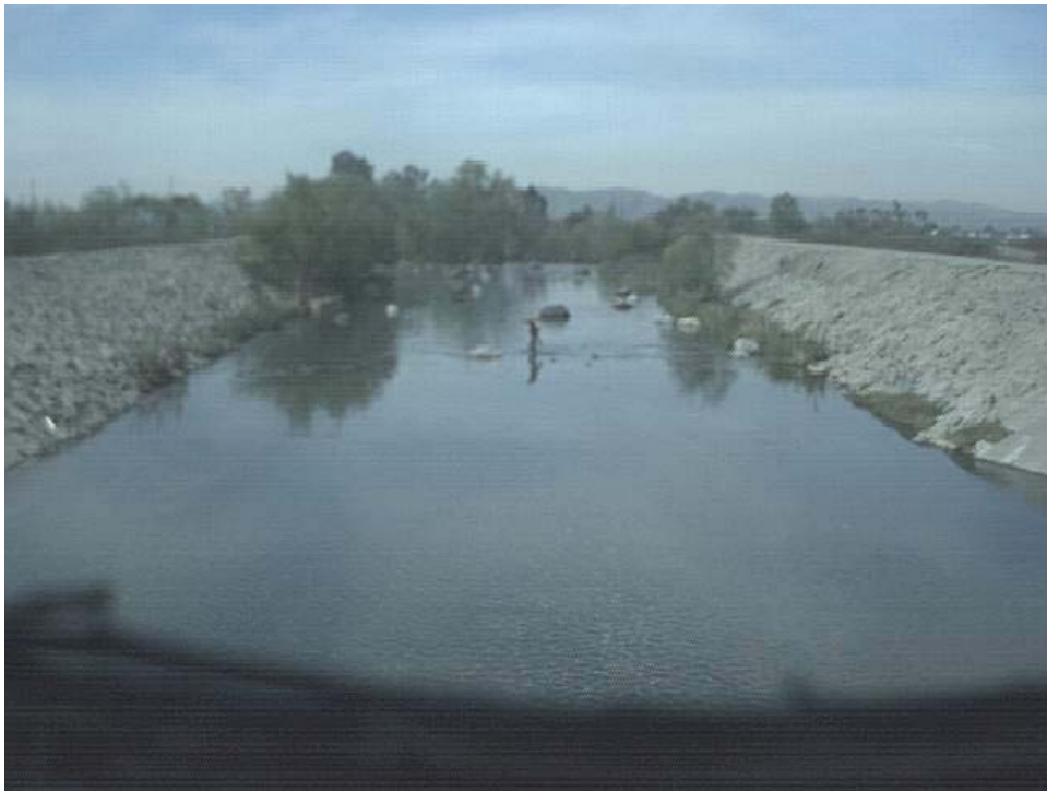
Contact Recreation: 3/25/2006 9:50