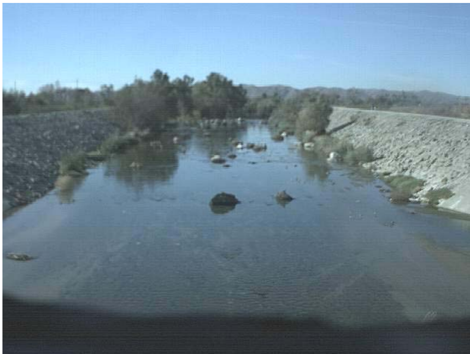
Figure 2b Photo of Cucamonga Creek, Looking Downstream from Hellman Avenue