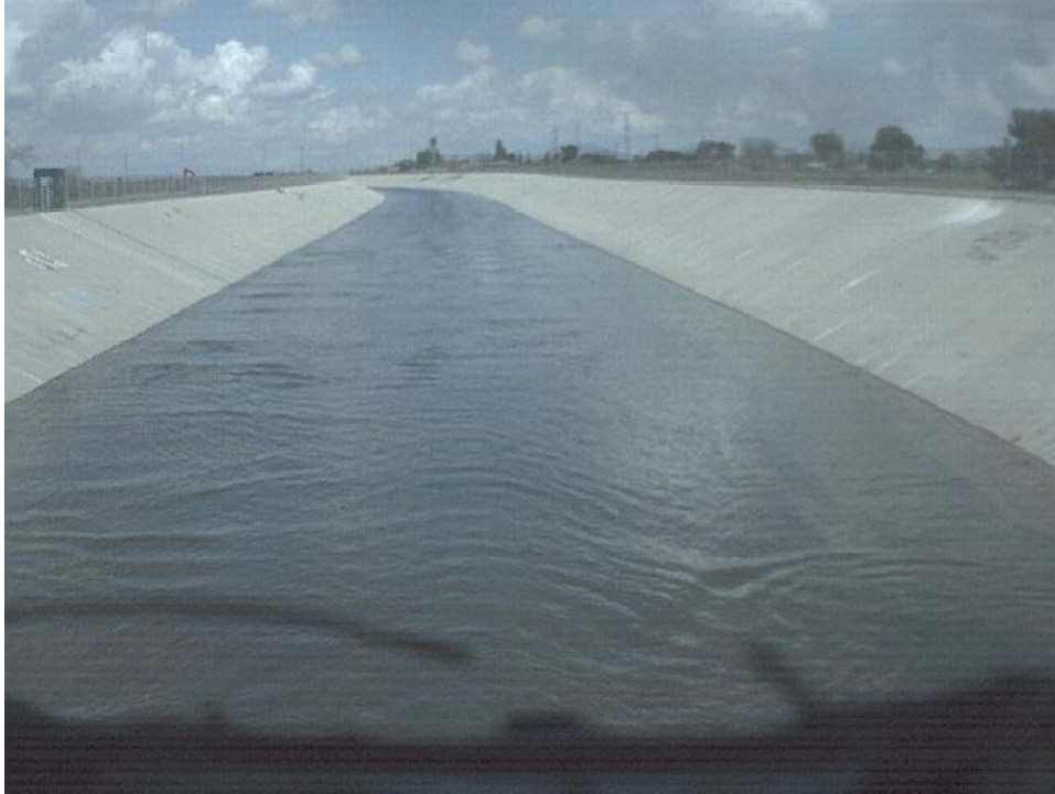
No Activitv: 1/4/2006 14:05