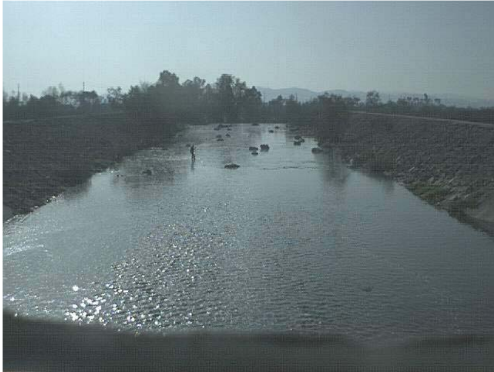
Contact Recreation: 1/8/2006 15:00