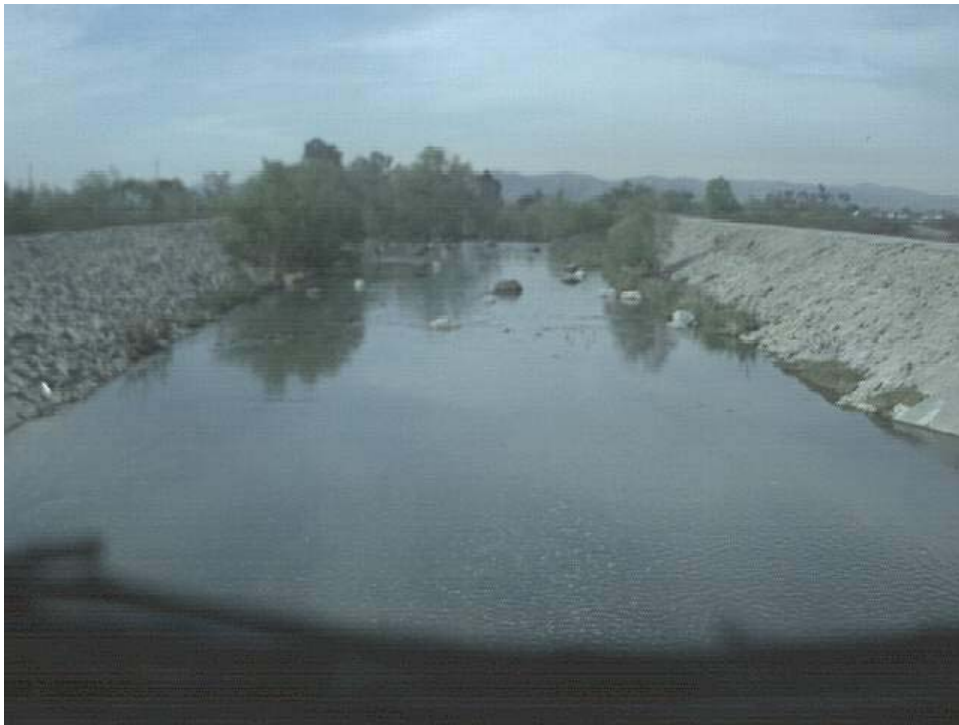
Contact Recreation: 3/25/2006 10:15