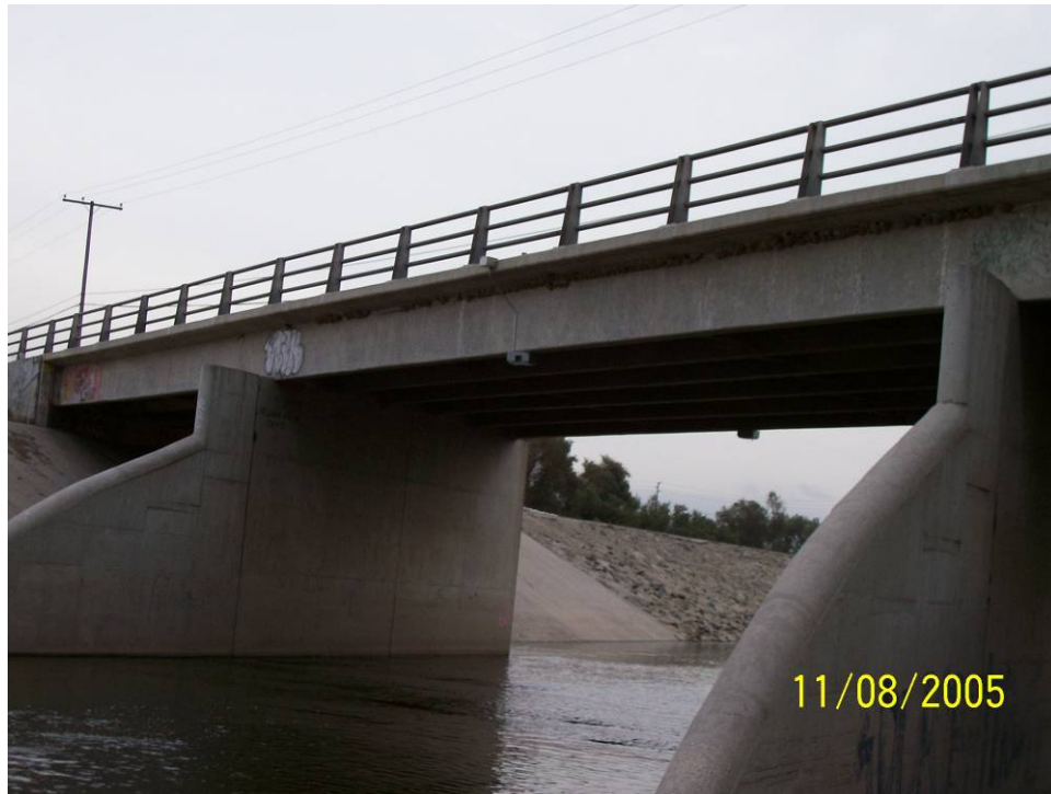
Figure 3a Photo of the Recreational Use Survey Camera Installation Looking Upstream at Hellman Avenue