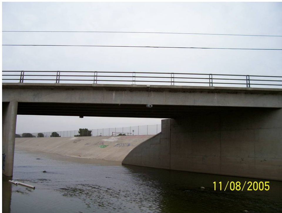
Figure 3b Photo of the Recreational Use Survey Camera Installation Looking Downstream at Hellman Avenue