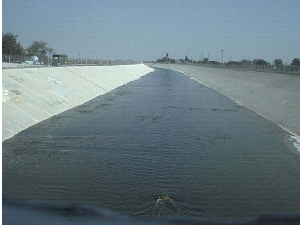
Figure 2a Photo of Cucamonga Creek, Looking Upstream from Hellman Avenue