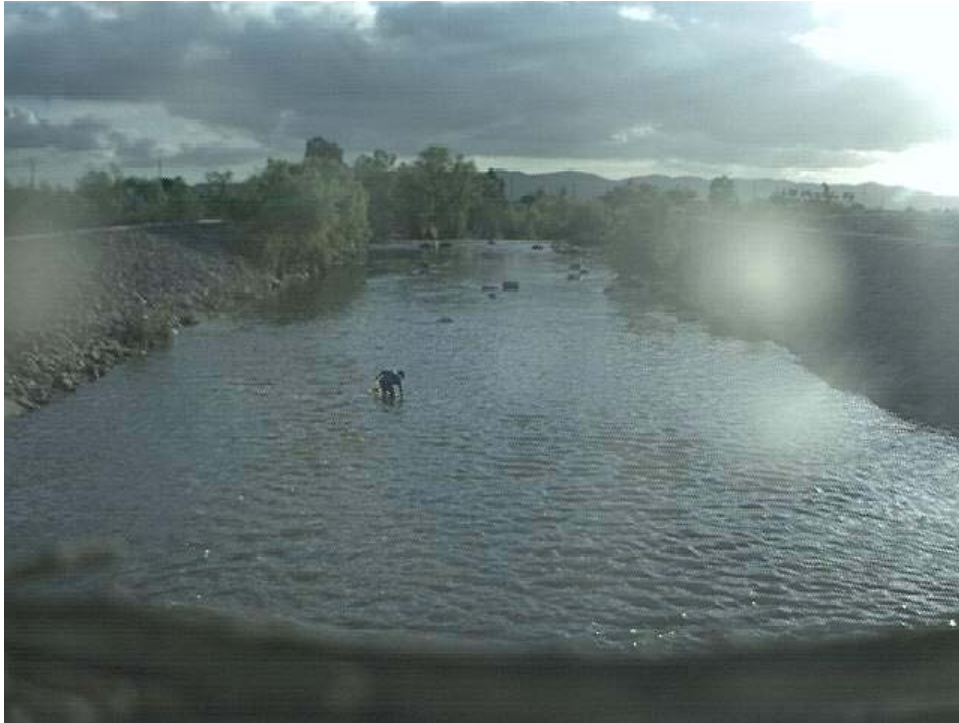
Contact Recreation: 3/29/2006 18:00