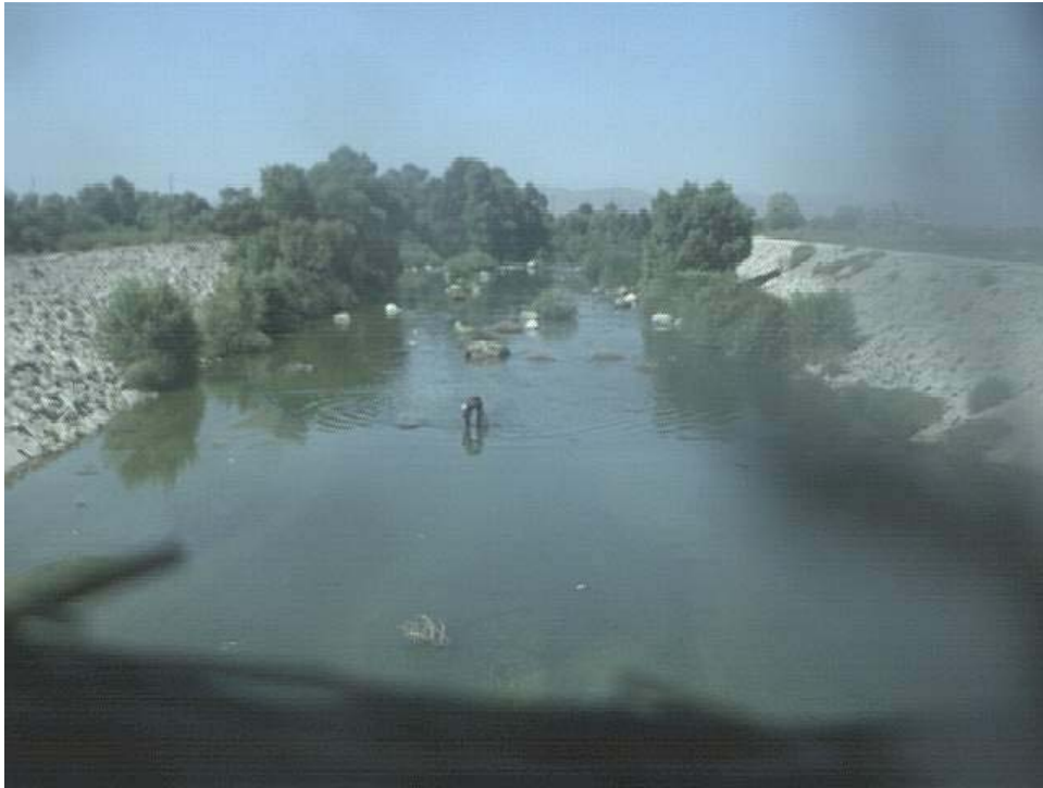
Contact Recreation: 8/25/2006 10:30