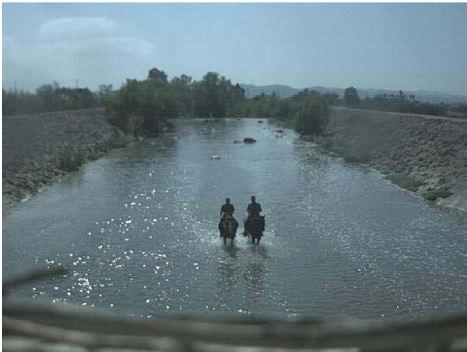
Non-Contact Recreation: 4/7/2006 14:15