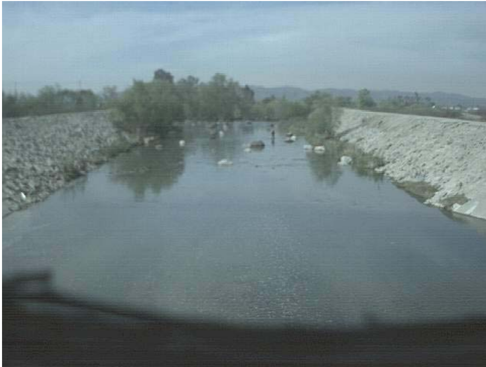
Contact Recreation: 3/25/2006 10:05