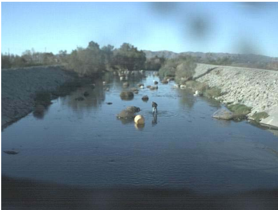
Contact Recreation: 12/24/2005 9:30