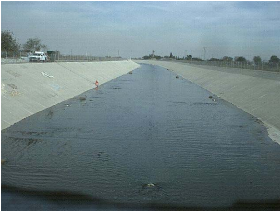
Maintenance: 12/1/2005 14:15