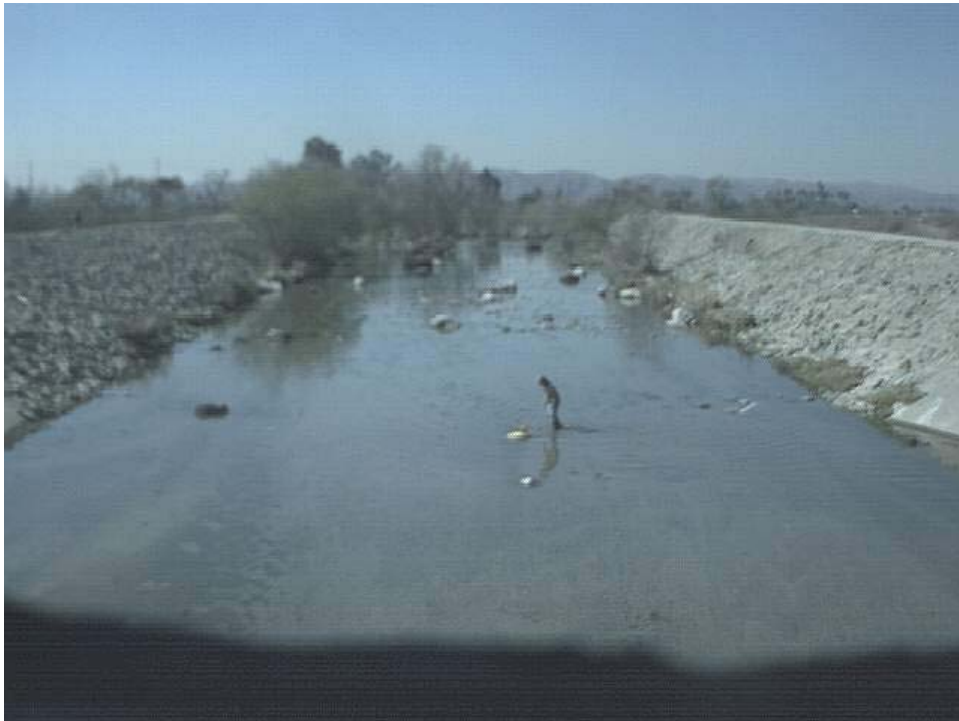
Contact Recreation: 2/22/2006 11:45