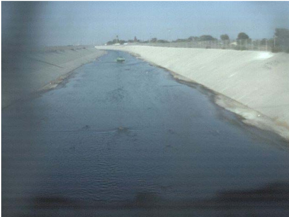
Non-Contact Recreation: 9/9/2006 17:00