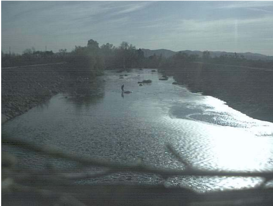
Contact Recreation: 3/14/2006 17:00