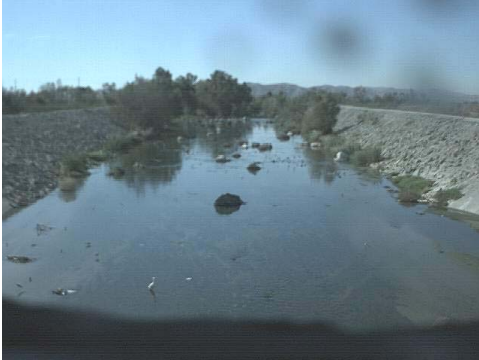
No Activity: 12/07/2005 12:35