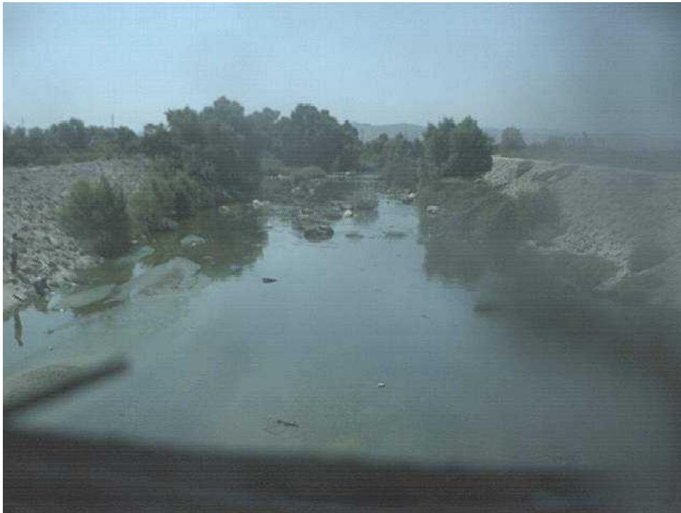
Contact Recreation: 9/13/2006 12:35