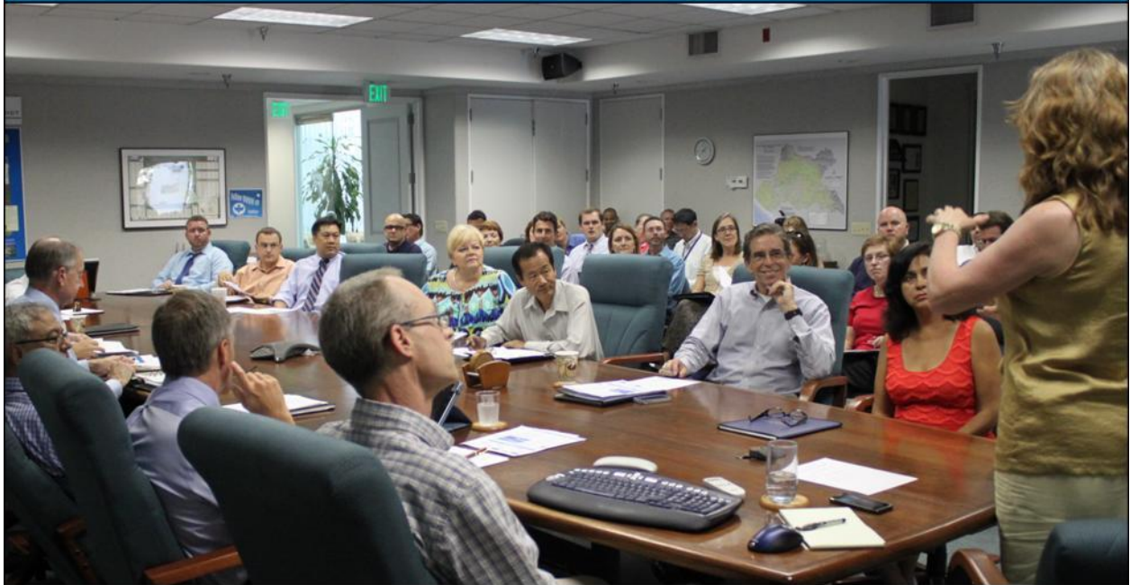
OWOW Call For Projects Workshop

As is likely to occur within any watershed, sometimes conflicting goals or priorities of various watershed agencies can hinder progress towards collaboration and coordination. Within the Santa Ana River Watershed there are over 100 large and small water districts ( Figure 2.3-1 on page 2), local, regional, State and Federal agencies, and public/private stakeholder groups. The Santa Ana Watershed Project Authority (SAWPA) recognizes that all of these stakeholders have their own valid interests in ensuring that there is sufficient clean, reliable water in the watershed, and SAWPA takes the initiative to keep all of these groups working together to solve the watershed's issues under One Water One Watershed (OWOW) 2.0 planning and various other "Roundtable" forums.